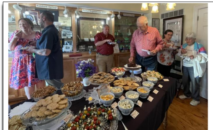
Native American Gallery reception guests enjoying the evening

Cabin project (damaged log replacement, electricity & new window installation); multiple private group tours including public and home school groups; presentations on new topics every open tour date. The presentations have become so popular that in order to resolve logistics issues with concurrent tours, presentations will now be held on the first and third Sundays, leaving tours on the second and fourth Sundays. Watch our website and →