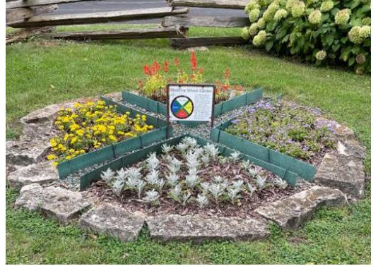
Clockwise: Lobby entrance. View from rear parking lot. Medicine Wheel behind the Trading Post